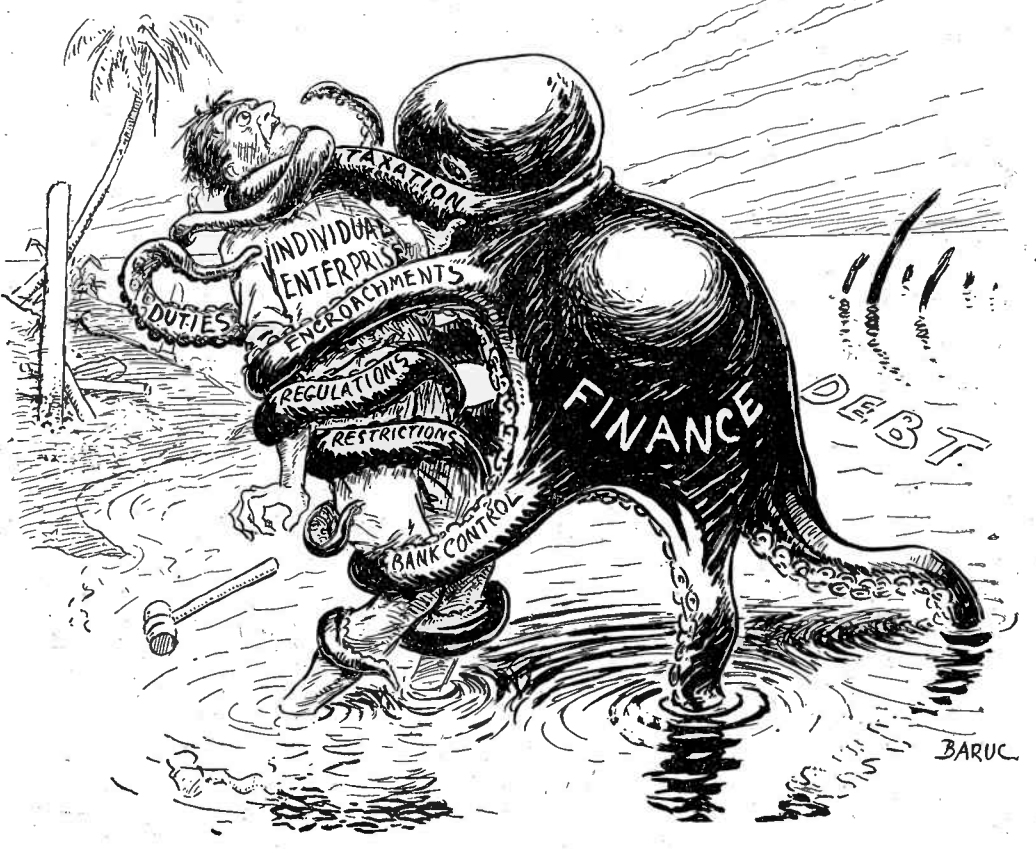
. Is It Too Late?

Of course this is partly true, which makes it a more dangerous lie. All evil is caused by wrong thinking because wrong thinking eventuates in wrong action, but the remedy is right thinking followed by right action, not inaction pending a vague, universal "change of heart" which—because it would take an indefinite time-might be expected to suit our hypothetical Devil to a T. He could quietly get on with his work while the forces of good did nothing.